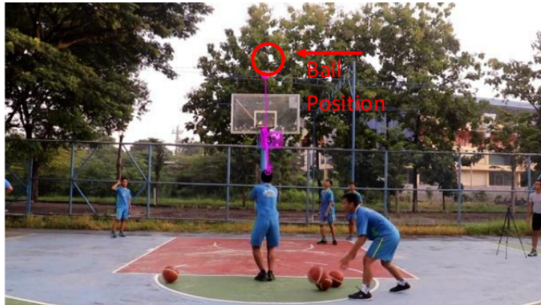
Figure 1. The Angle between the maximal ball position with the basket

This is a quantitative research with comparative study. There are four main data in this research, such as ball direction, launching angle, ball velocity, and maximum elevation. The ball direction was recorded by Canon 80D + Canon 18-135 mm STM with HD 50 fps (1280 x 720). The launching angle, ball velocity, and maximum elevation were recorded by GoPro Hero 5 Action Camera with 120 fps (1080 x 720).